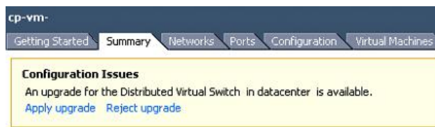
Figure 3: vSphere Client DVS Summary Tab

Step 2 Click the vSphere Client DVS Summary tab to check for the availability of a software upgrade.