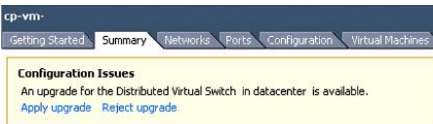
Figure 3: vSphere Client DVS Summary Tab

Step 2 Click the vSphere Client DVS Summary tab to check for the availability of a software upgrade.