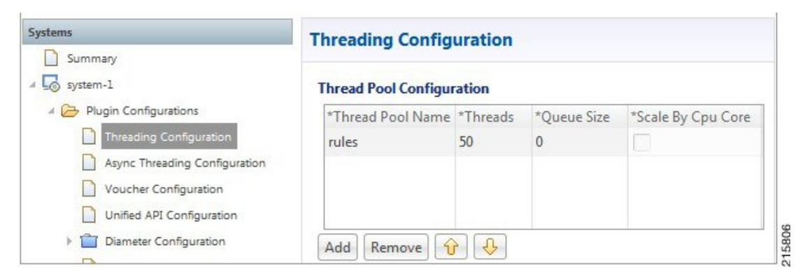
Figure 1: Threading Configuration