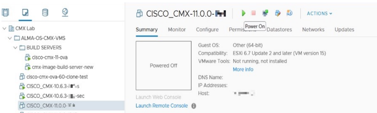
Figure 9: Power On VM

Step 12 Click Power on to power on the VM. The first boot takes a while because the new disk has to be expanded.