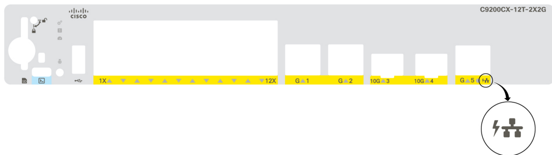
Table 4: PD Power LED