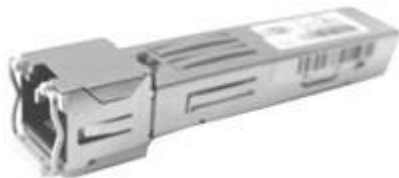
Figure 1: Cisco 1000BASE-T Copper SFP (GLC-T)

You can attach a monitor to the server, or, if Cisco Integrated Management Controller (CIMC) is configured, you can use a remote KVM (on UCS C220-M3 and C220-M4 servers).