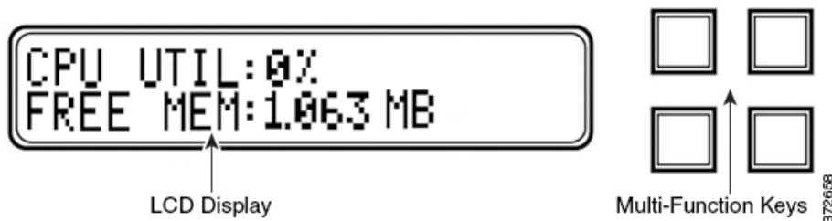
Figure 4-1 LCD Panel, Idle Display mode

In Idle Display mode, the panel alternates between displaying the CPU utilization and free memory available, and the chassis serial number. Press any key to interrupt the Idle Display mode and enter the LCD panel’s main menu where you can access Network Configuration, System Status, and Information modes.