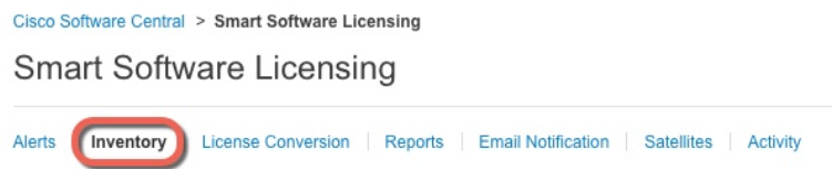
Figure 2: Inventory