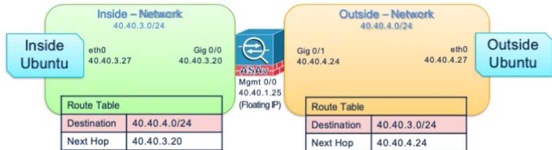
Figure 2: Sample ASAv on OpenStack Deployment