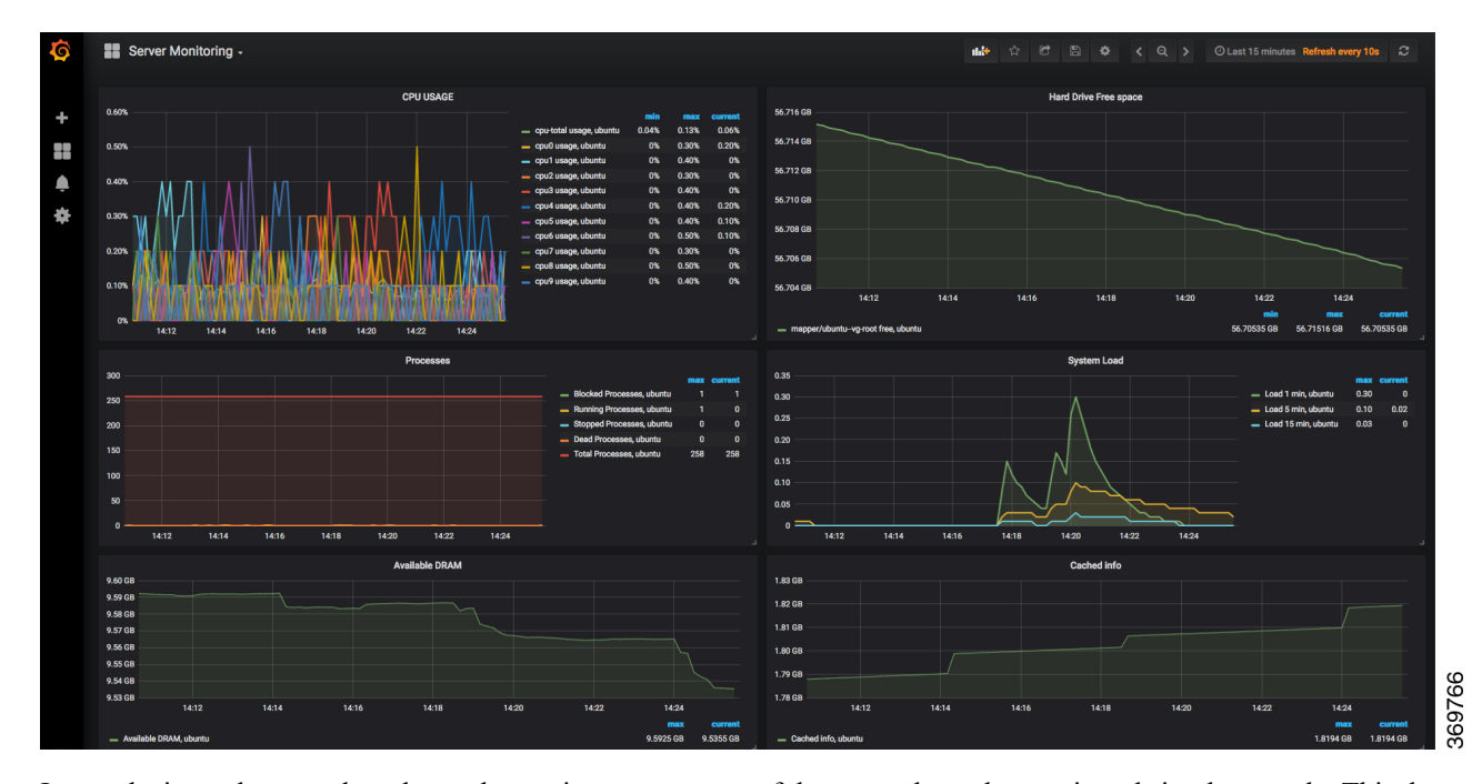
Figure 3: Visual Analysis of System Monitoring using Telemetry Data

In conclusion, telemetry data shows that various parameters of the network can be monitored simulatanously. This data is streamed in near real-time without affecting the performance of the network. With this data, you gain better visibility into your network.