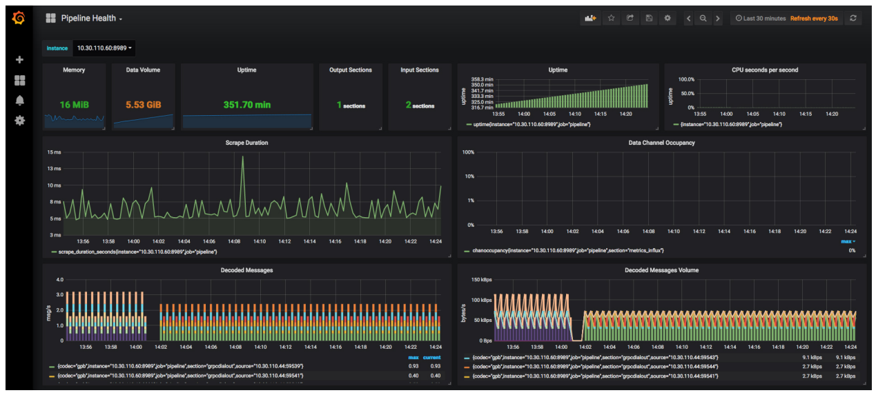
Figure 2: Visual Analysis of Network Health using Telemetry Data

Step 2 Use Grafana to create a dashboard and visualize the streamed data.