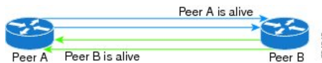
Figure 1: BFD Asynchronous Mode

Control packet failure in asynchronous mode (without echo), is detected using the values of the minimum interval ( bfd minimum-interval ) and multiplier ( bfd multiplier ) commands. For control packet failure detection, the local multiplier value is sent to the neighbor. A failure detection timer is started based on (I \times M) , where I is the negotiated interval, and M is the multiplier provided by the remote end. Whenever a valid control packet is received from the neighbor, the failure detection timer is reset. If a valid control packet is not received from the neighbor within the time period (I \times M) , then the failure detection timer is triggered, and the neighbor is declared down.