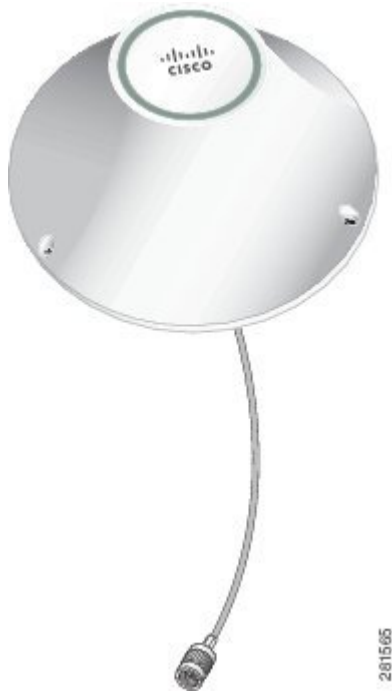
Figure 1: 4G Volcano Antenna