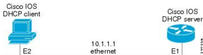
Figure 2: Topology Showing DHCP Client with GigabitEthernet Interface

On the DHCP server, the configuration is as follows: