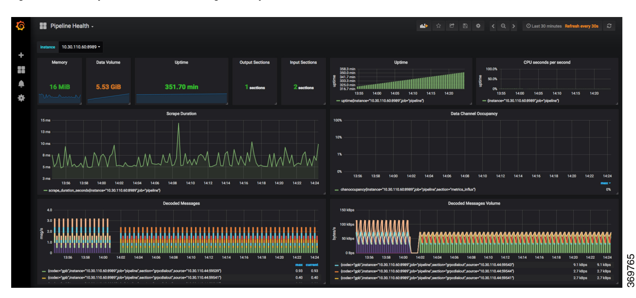
Figure 3: Visual Analysis of System Monitoring using Telemetry Data