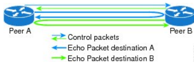
Figure 2: BFD Asynchronous Mode With Echo Packets

For more information about control and echo packet intervals in asynchronous mode, see the BFD Packet Intervals and Failure Detection .