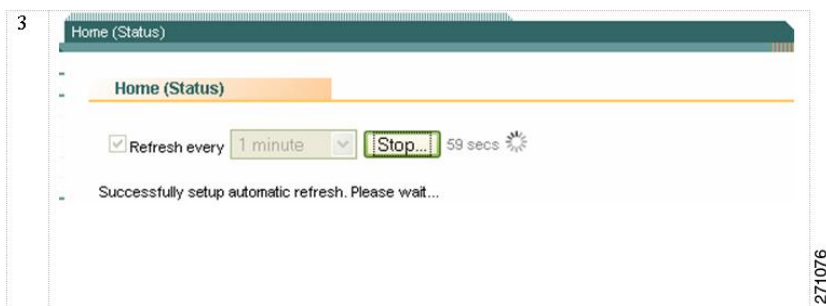
Figure 4: Auto Refresh Counter Example

The web user interface screen refreshes every time this counter reaches 0 seconds.