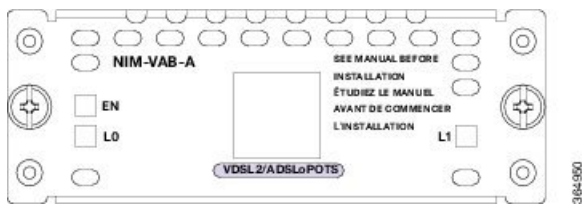
Figure 2: NIM Annex M