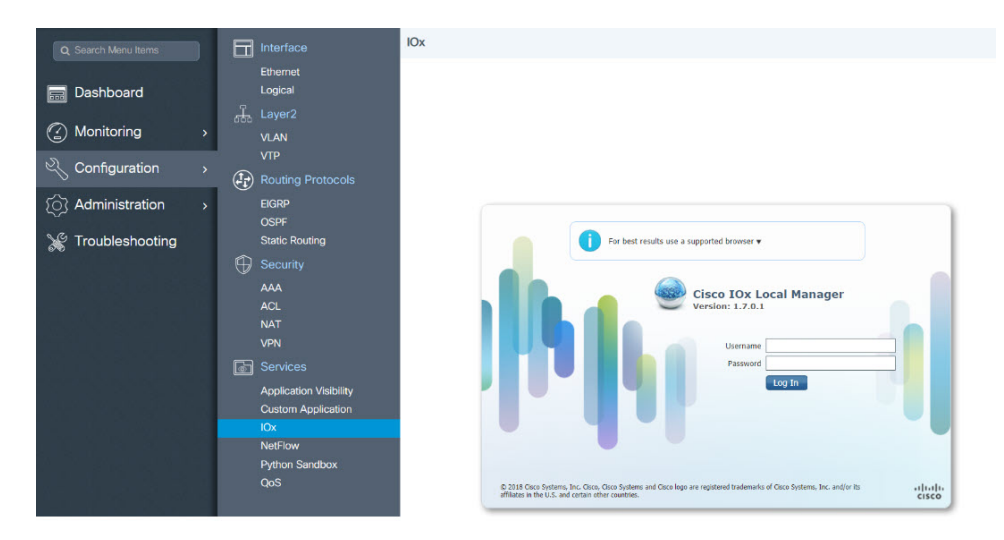
Figure 1: Local Manager

The syntax for the second method is https://I R1101-IP-ADDRESS and then navigate to IOx as shown in the following: