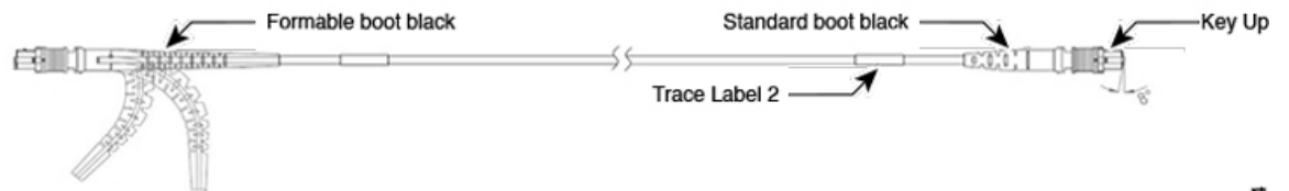
Figure 2: Cable with Formable Boot and Standard Boot