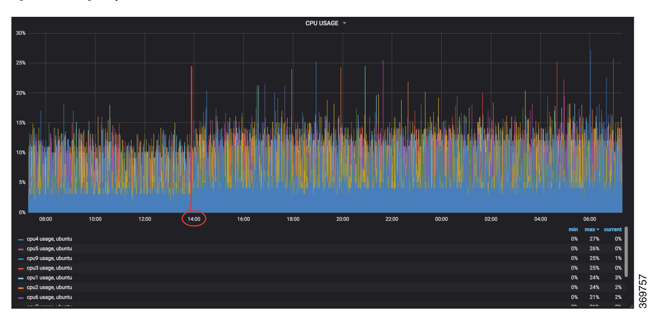
Figure 3: CPU Usage Graph with Two Routers