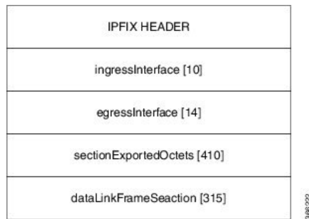
Figure 2: IPFIX 315 Export Packet Format

A special cache type called Immediate Aging is used while exporting the packets. Immediate Aging ensures that the flows are exported as soon as they are added to the cache. Use the command cache immediate in flow monitor map configuration to enable Immediate Aging cache type.