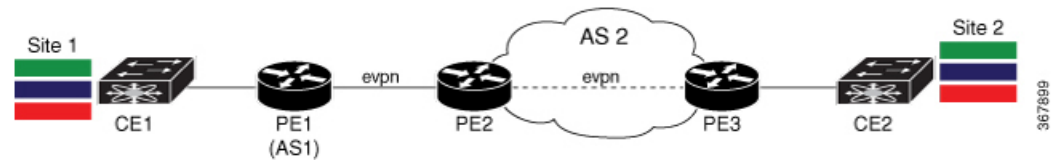
Figure 4: BGP over MPLS (Inter AS)