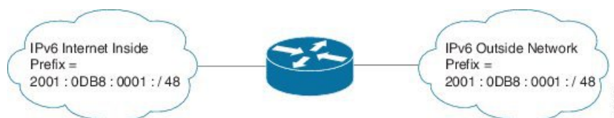
Figure 1: NPTv6 using Single Inside and Outside Network

The figure below illustrates NPTv6 deployment having a single inside and outside network.