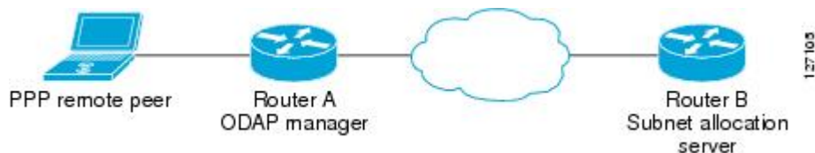
Figure 2: Subnet Allocation Server Topology

When the ODAP manager allocates a subnet, the subnet allocation server creates a subnet binding. This binding is stored in the DHCP database for as long as the ODAP manager requires the address space. The binding is removed and the subnet is returned to the subnet pool only when the ODAP manager releases the subnet as address space utilization decreases.