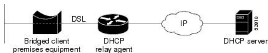
Figure 2: Network Topology Using ATM RBE and DHCP

This feature communicates information to the DHCP server using a suboption of the DHCP relay agent information option called agent remote ID . The information sent in the agent remote ID includes an IP address identifying the relay agent and information about the ATM interface and the PVC over which the DHCP request came in. The DHCP server can use this information to make IP address assignments and security policy decisions.