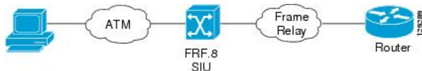
Figure 1: Frame Relay-to-ATM Interworking

You can configure ATM PVCs for IETF-compliant LLC encapsulated PPP over ATM on either point-to-point or multipoint subinterfaces. Multiple PVCs on multipoint subinterfaces significantly increase the maximum number of PPP-over-ATM sessions running on a router.