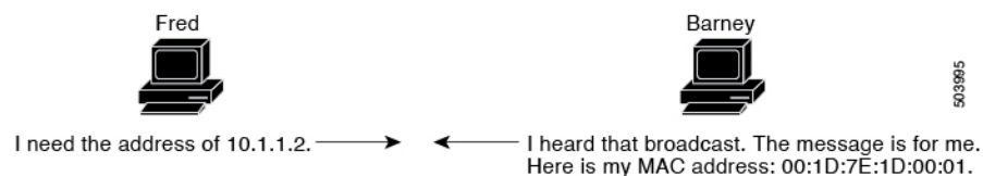
Figure 1: ARP Process

When the destination device lies on a remote network that is beyond another device, the process is the same except that the device that sends the data sends an ARP request for the MAC address of the default gateway. After the address is resolved and the default gateway receives the packet, the default gateway broadcasts the destination IP address over the networks connected to it. The device on the destination device network uses ARP to obtain the MAC address of the destination device and delivers the packet. ARP is enabled by default.