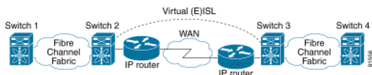
Figure 1 Fibre Channel SANs Connected by FCIP

FCIP uses Transmission Control Protocol (TCP) on port 3225 as a network layer transport.