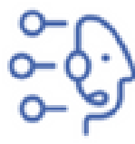
Virtual Agent Google DialogFlow CX