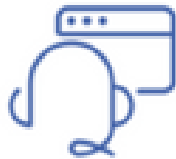
WebRTC Agent Desktop