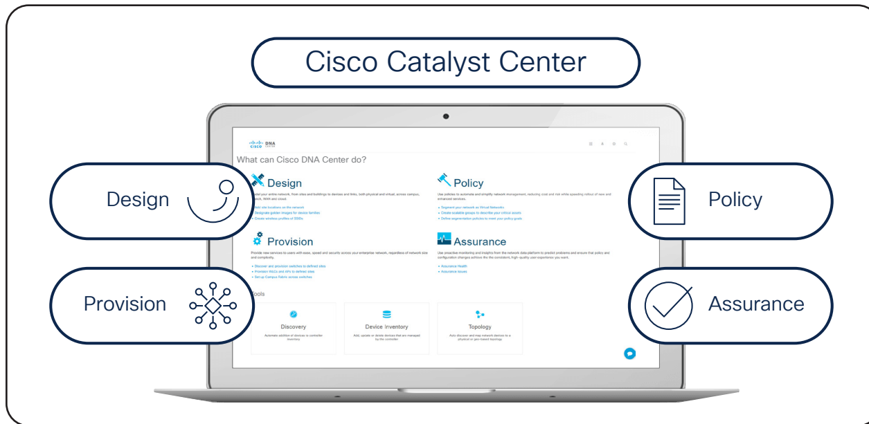
Figure 3. Pictured, the command center for Cisco Catalyst Center (formerly DNA Center) and the features provided

The command center for your wireless network needs to be as reliable and secure as the devices it controls. From management to automation to analytics to security, Cisco Catalyst Center runs your network, provisioning and configuring all of