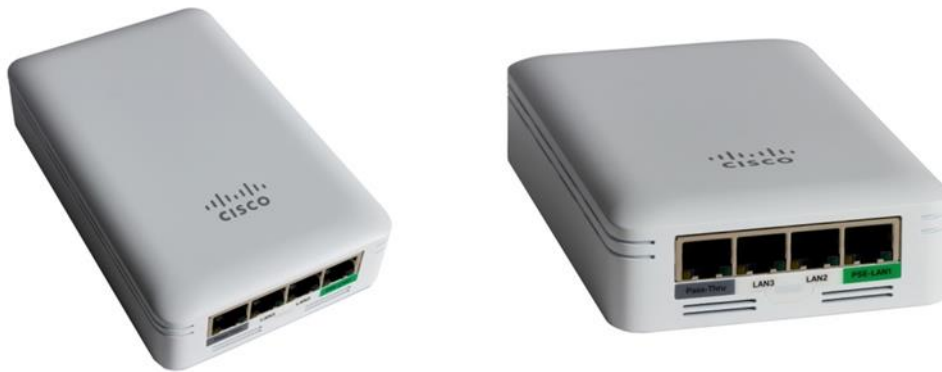
Figure 1. Cisco Aironet 1815w Access Point

Packing 802.11ac Wave 2 wireless support and Gigabit Ethernet wired connectivity into a sleek device, the 1815w is built to take full advantage of existing cabling infrastructure while blending into the visual footprint. This combination provides best-in-class performance while reducing total cost of ownership.