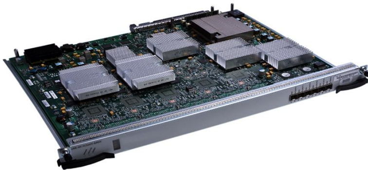
Figure 1. Cisco uBR-MC3GX60V-RPHY Broadband Processing Engine

There are 72 DOCSIS downstream and 60 upstream channels per card, so the Cisco uBR-MC3GX60V-RPHY BPE supports the same benchmark for scalable, fast, and cost-effective DOCSIS 3.0 Cable Modem Termination System (CMTS) solutions maintained by the Cisco uBR-MC3GX60V Broadband Processing Engine (BPE). With the new Cisco uBR-MC3GX60V-RPHY BPE, the Cisco uBR10012 platform scales up to 576 modular DOCSIS downstream channels and 480 upstream channels, (approximately 24 Gbps of downstream throughput and 14.4 Gbps of upstream throughput) in a single, carrier-class chassis as part of our Remote-PHY solution. On top of this, with the introduction of virtual combining, the bandwidth can be further scaled in the Ethernet domain to support more CMC hosted upstream channels and as many CMC downstream channels as required. The limit for downstream channels is based on the available bandwidth to be delivered to and from each CMC. This evolution moves the traditional RF combining of multiple service areas into CMTS ports to the Ethernet domain, allowing virtual combining to greatly enhance network scalability.