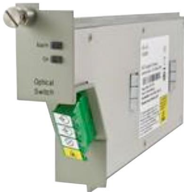
Figure 1. Optical Switch Module

The optical switch module in the Prisma II XD chassis module form factor features Subscriber Connector/Angle-Polished Physical Contact (SC/APC) connectors for input and output optical connections. For use in the full-height Prisma II chassis, a host module adaptor is available.