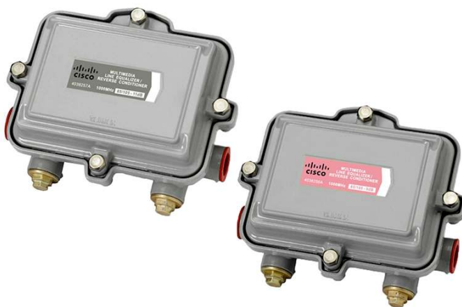
Figure 1. Cisco Multimedia Line Equalizer/Reverse Conditioner

With greater percentages of devices, such as high-speed data and telephony modems, transmitting in the upper end of their RF transmit ranges, improvements in carrier-to-ingress and carrier-to-noise performance can be realized.