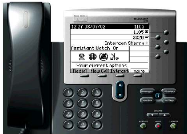
Figure 2. Manager's Phone Interface

An IP phone-based user interface allows managers to monitor the way their calls are being handled, and a simplified set of soft keys enables them to handle calls without needing the full range of functions they have delegated to their assistants. Administrators can customize the soft key template on the manager's phone to match the manager's preferences (Figure 2).