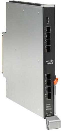
Figure 4. Cisco Nexus B22 Blade Fabric Extender for Dell