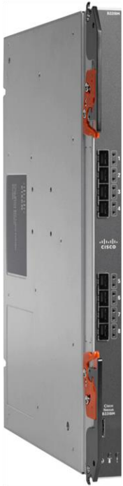
Figure 5. Cisco Nexus B22 Blade Fabric Extender IBM