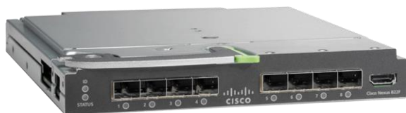
Figure 3. Cisco Nexus B22 Blade Fabric Extender for Fujitsu