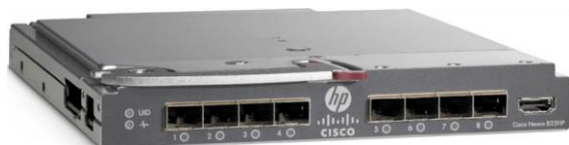
Figure 2. Cisco Nexus B22 Blade Fabric Extender for HP

The Cisco Nexus B22 comes in four models. Figure 2 shows the Cisco Nexus B22 Blade Fabric Extender for HP. Figure 3 shows the Cisco Nexus B22 Blade Fabric Extender for Fujitsu. Figure 4 show the Cisco Nexus B22 Blade Fabric Extender for Dell. Figure 5 shows the Cisco Nexus B22 Blade Fabric Extender for IBM.