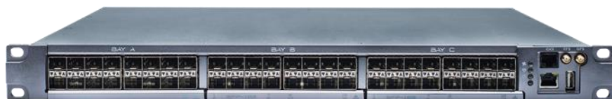
Figure 2. Cisco Nexus 3550-F Programmable Layer 2 Application Platform