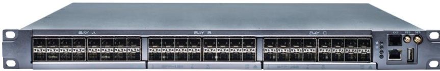
Figure 3. Cisco Nexus 3550-F Modular Layer 1 Matrix Switch / Cisco Nexus 3550-F Programmable Multiplexer Switch

The Mux mode offers 1G and 10G Ethernet options, with the ability to rate convert between these rates. It also offers Layer 2 and VLAN based demultiplexing. These features are designed for low latency long range wireless telecommunication networks where many customers require access to the same low-speed radio link.