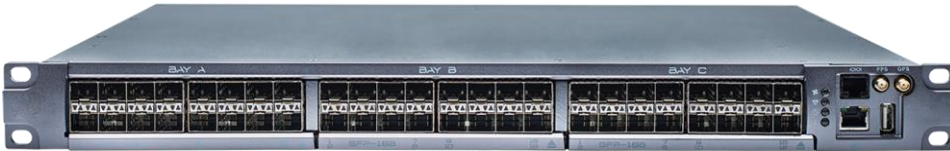
Figure 1. Cisco Nexus 3550-F HPT

Many users rate our CLI (Command Line Interface) as one of the best they have used. Every command available on the CLI is also available via a remote JSON RPC API. This makes the switch easy to operate and to manage at scale. All Cisco Nexus 3550-F platforms and switches include standard enterprise manageability and deploy ability features, including automatic configuration (via DHCP), SNMP, TACACS+ authentication, onboard Python programmability, BASH shell access, and time-series logging.