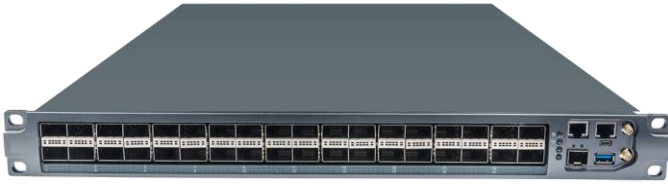
Figure 1. Cisco Nexus 3550-H High-density Layer 1-144 Switch