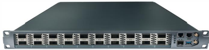
Figure 2. Cisco Nexus 3550-H High-density Layer 1-160 Switch

The Cisco Nexus 3550-H. A patch is configured between ports 1 and 3: all traffic from port 1 is directed to port 3, all traffic from port 3 is directed to port 1. Taps are configured from port 1 to ports 4 and 5: traffic from port 1 is replicated to ports 4 and 5 at latencies as low as 3.2ns.