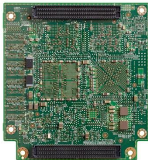
ESS 3300 Mainboard