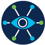
Full-stack visibility and control

With Cisco Intersight Workload Optimizer and Kubernetes