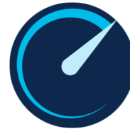
Hybrid cloud optimization