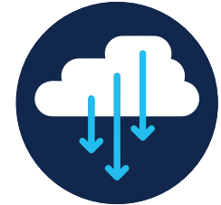
Manage locally or from the cloud