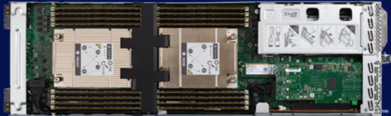
Cisco UCS C125 M5 Rack Server Node