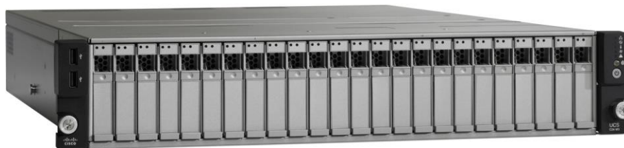
Figure 1. Cisco UCS C24 M3 Server

The Cisco UCS C24 M3 server interfaces with Cisco UCS using another Cisco® innovation: the Cisco UCS Virtual Interface Card 1225. The Cisco UCS Virtual Interface Card 1225 is a virtualization-optimized Fibre Channel over Ethernet (FCoE) PCIe 2.0 x8 10-Gbps adapter designed for use with Cisco UCS C-Series Rack Servers. The Virtual Interface Card 1225 is a dual-port 10 Gigabit Ethernet PCIe adapter that can support up to 18 PCIe standards-compliant virtual interfaces, which can be dynamically configured so that both their interface type (network interface card [NIC] or host bus adapter [HBA]) and identity (MAC address and worldwide name [WWN]) are established using just-in-time provisioning. In addition, the Cisco UCS VIC 1225 can support network interface virtualization and Cisco Data Center Virtual Machine Fabric Extender (VM-FEX) technology.