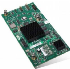
Figure 1. Cisco UCS M81KR Virtual Interface Card

A Cisco® innovation, the Cisco UCS M81KR Virtual Interface Card (VIC) is a virtualization-optimized Fibre Channel over Ethernet (FCoE) mezzanine card designed for use with Cisco UCS B-Series Blade Servers (Figure 1). The VIC is a dual-port 10 Gigabit Ethernet mezzanine card that supports up to 128 Peripheral Component Interconnect Express (PCIe) standards-compliant virtual interfaces that can be dynamically configured so that both their interface type (network interface card [NIC] or host bus adapter [HBA]) and identity (MAC address and worldwide name [WWN]) are established using just-in-time provisioning. In addition, the Cisco UCS M81KR supports Cisco VN-Link technology, which adds server-virtualization intelligence to the network.