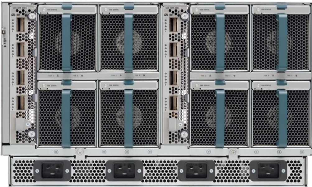
Figure 2. Rear of Cisco UCS 5108 Blade Server Chassis with Two Cisco UCS 2304 Fabric Extenders Inserted

Cisco UCS 2304 Fabric Extenders fit into the back of the Cisco UCS 5100 Series chassis. Each Cisco UCS 5100 Series chassis can support up to two fabric extenders, allowing increased capacity and redundancy (Figure 2).