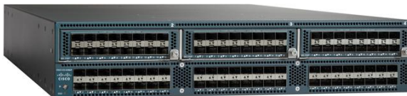
Figure 4. Cisco UCS 6296UP 96-Port Fabric Interconnect

The Cisco UCS 6296UP 96-Port Fabric Interconnect (Figure 4) is a 2RU 10 Gigabit Ethernet, FCoE, and native Fibre Channel switch offering up to 1920 Gbps of throughput and up to 96 ports. The switch has forty-eight 1/10-Gbps fixed Ethernet, FCoE, and Fibre Channel ports and three expansion slots.