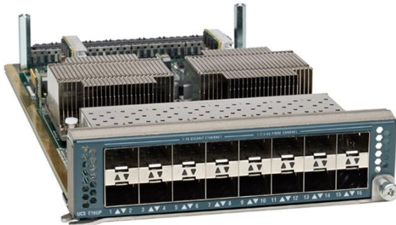
Figure 5. Unified Port 16-Port Expansion Module

The Cisco UCS 6200 Series supports an expansion module that can be used to increase the number of 10 Gigabit Ethernet, FCoE, and Fibre Channel ports (Figure 5). This unified port module provides up to 16 ports that can be configured for 10 Gigabit Ethernet, FCoE, and 1/2/4/8-Gbps native Fibre Channel using the SFP or SFP+ 3 interface for transparent connectivity with existing Fibre Channel networks.