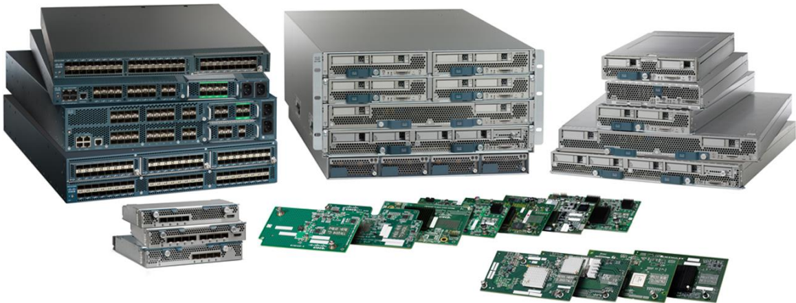
Figure 2. Cisco UCS 6200 Series Fabric Interconnects

The Cisco UCS 6200 Series uses a cut-through networking architecture, supporting deterministic, low-latency, line-rate 10 Gigabit Ethernet on all ports, switching capacity of 2 terabits (Tb), and bandwidth of 320 Gbps per chassis, independent of packet size and enabled services. The product family supports Cisco® low-latency, lossless 10 Gigabit Ethernet 1 unified network fabric capabilities, which increase the reliability, efficiency, and scalability of Ethernet networks. The fabric interconnect supports multiple traffic classes over a lossless Ethernet fabric from the blade through the interconnect. Significant TCO savings come from an FCoE-optimized server design in which network interface cards (NICs), host bus adapters (HBAs), cables, and switches can be consolidated.