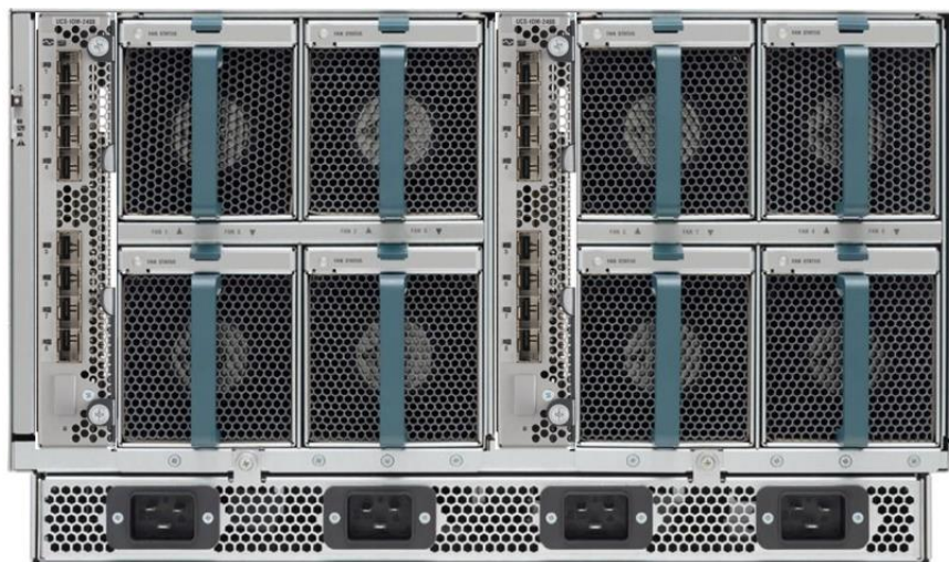
Figure 2. Rear of Cisco UCS 5108 Blade Server Chassis with two Cisco UCS 2408 Fabric Extenders

The Cisco UCS 2408 Fabric Extender has eight 25-Gigabit Ethernet, FCoE-capable, Small Form-Factor Pluggable (SFP28) ports that connect the blade chassis to the fabric interconnect. Each Cisco UCS 2408 provide 10-Gigabit Ethernet ports connected through the midplane to each half-width slot in the chassis, giving it a total 32 10G interfaces to UCS blades. Typically configured in pairs for redundancy, two fabric extenders provide up to 400 Gbps of I/O from FI 6400 series to 5108 chassis.