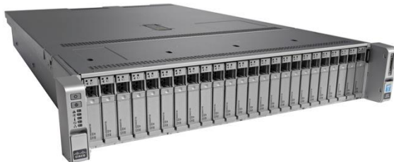
Figure 2. Cisco Security Packet Analyzer 2400