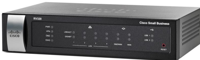
Figure 1. Cisco RV320 Dual Gigabit WAN VPN Router

Network connectivity is at the heart of every small business, and secure access, firewall protection, and high performance are the cornerstones of every Cisco® Small Business RV Series Router. The Cisco RV320 Dual Gigabit WAN VPN Router is no exception. With an intuitive user interface, the Cisco RV320 enables you to be up and running in minutes. The Cisco RV320 provides reliable, highly secure access connectivity for you and your employees that is so transparent you will not know it is there.